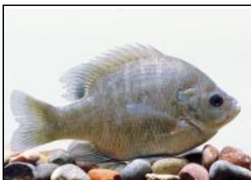
Figure 3. Bluegill make excellent continuous forage for bass.

Transferred fry are more uniform in size if individual schools are seined. All fry should be the same age, as nearly as possible, because fingerlings become cannibalistic at about 2 inches in length. There-